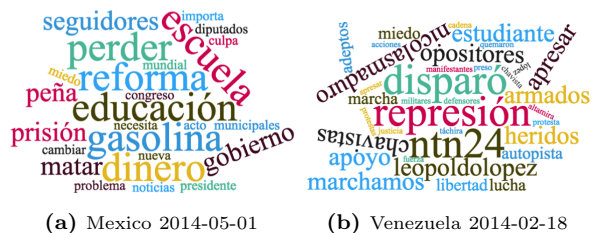
Figure 2: Word cloud representing censored keywords in News identified by our method