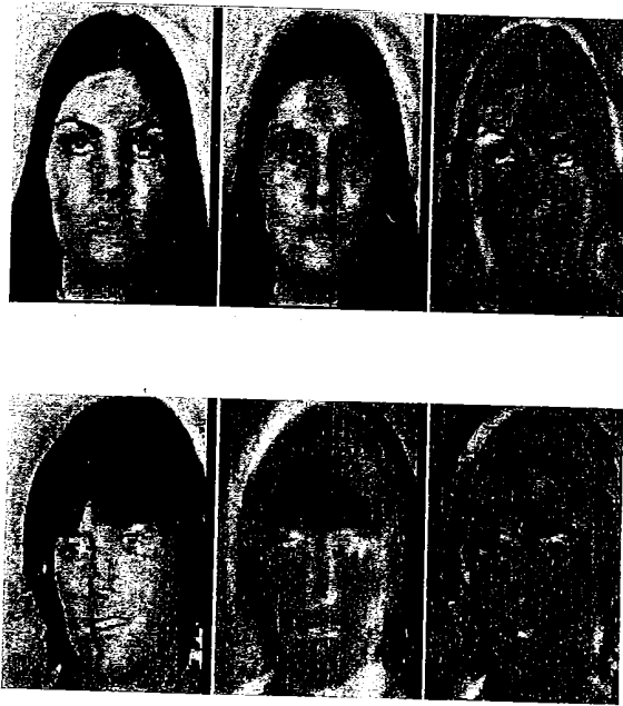
Figure 2. The leftmost panel shows two original faces. The center panel shows each face reconstructed with the first 35 eigenvectors. Global shape information is well preserved in these reconstructions. The rightmost panel shows the two faces reconstructed with the 20th through 55th eigenvectors. Small local details are well preserved in these reconstructions.

to all learned faces, and hence, the worse the human recognition performance.