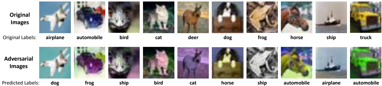
Figure 1: Samples of CIFAR10 original images (top) and semantic adversarial examples (bottom) on VGG16 network. Adversarial images are generated by converting original images into the HSV color space and randomly shifting the Hue and Saturation components, while keeping Value the same. All images in first row are correctly classified by the model.

Department of Electrical Engineering, University of Washington, Seattle, WA