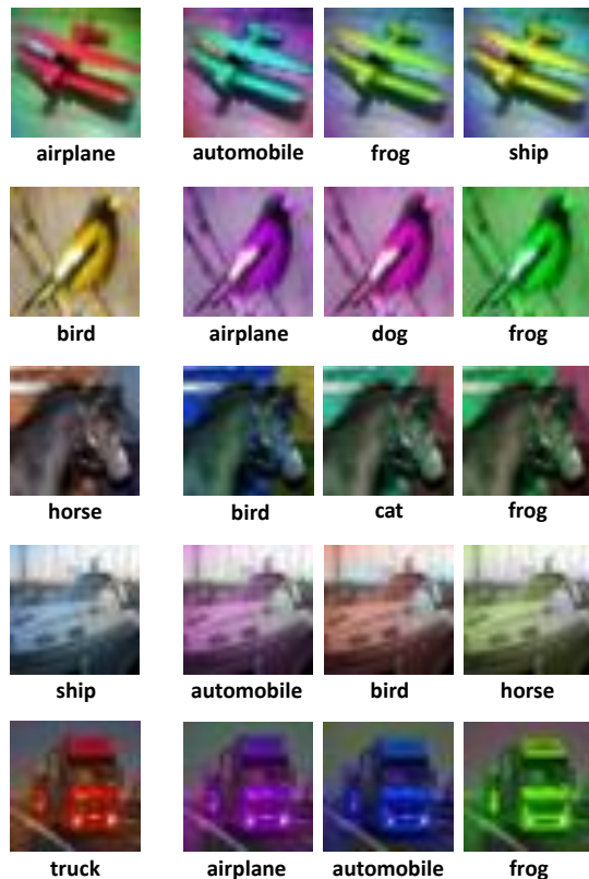
Figure 4: Sample images of CIFAR10 dataset, along with three color-shifted versions classified into different labels by VGG16 network. The leftmost-column shows original images.

model is robust to perturbations around data points, it does not provide robustness to semantic adversarial examples.