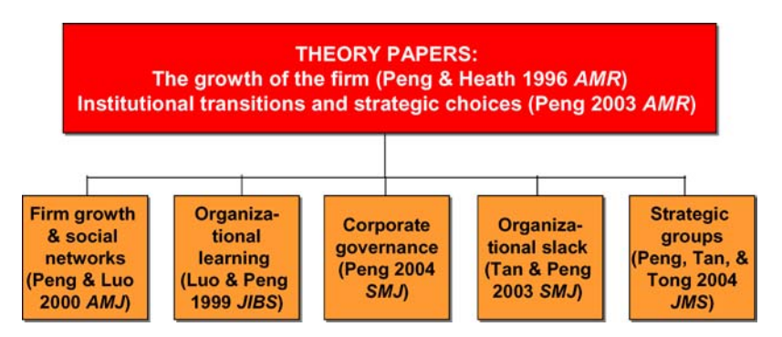
Figure 1. China research, mainstream topics.