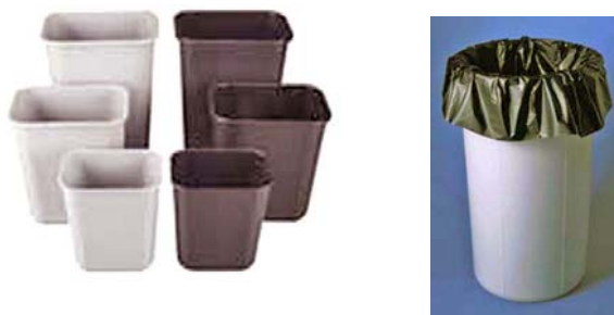
EXAMPLES OF TYPICAL TRASH CANS

There are regular trash cans placed at specific locations in the organic lab. Unfortunately, certain regulations limit the amount of trash cans that can be placed in each lab. As a result there might not be one handy when you need it. This in turn makes it tempting to place trash in broken glass boxes. Please take the time to locate a regular trash can and place items such as paper, gloves, and other harmless waste in them, even if you have to walk a little longer.