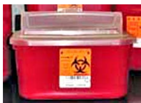
A TYPICAL SHARPS CONTAINER

Sharp objects also require a special container. This container is typically a red plastic box located in the waste hood. The container is designed so that objects can go in easily, but cannot be taken out. Examples of sharp objects commonly used in the organic lab are disposable syringe needles. Please place such items in the sharp objects box.